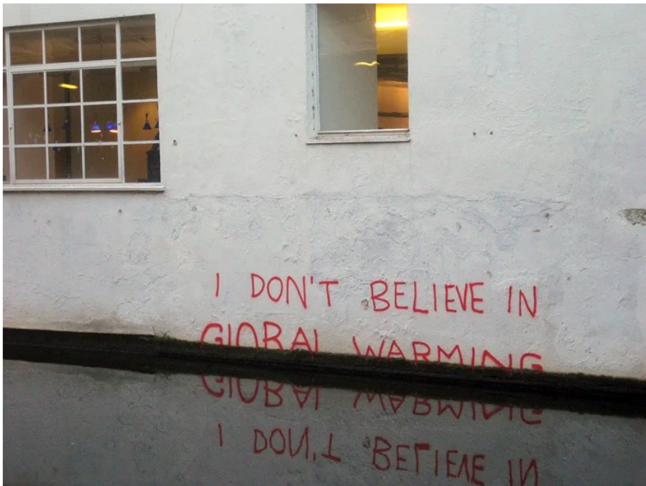
Banksy. I don't believe in Global warming . London (2009)