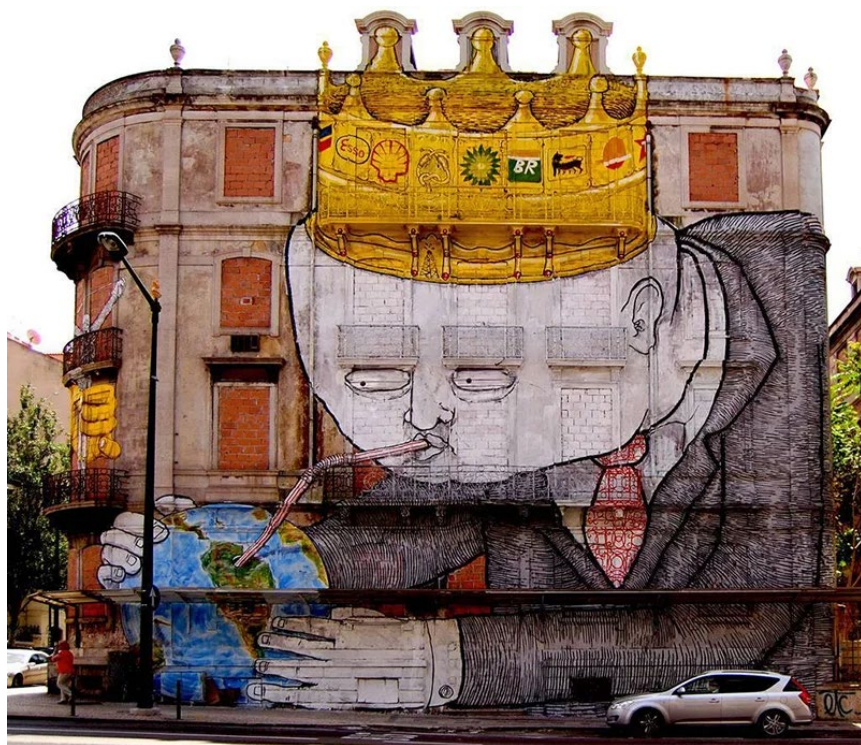
Blu. Sede insaciável . Lisboa –Av. Fontes Pereira de Melo (2015)